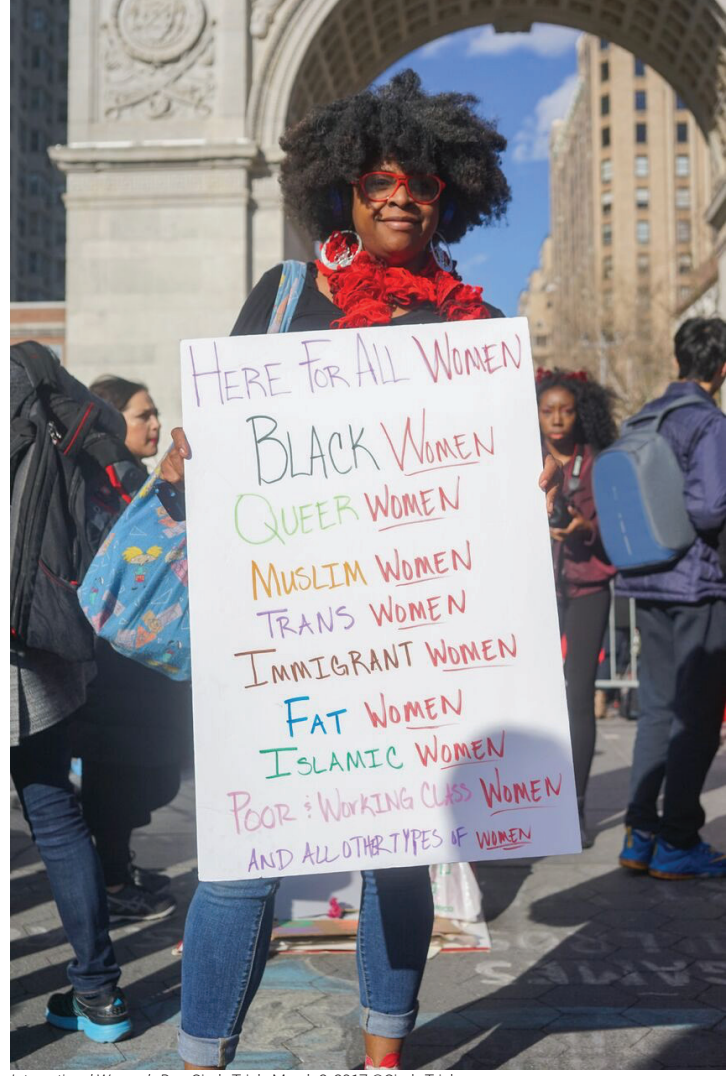
International Women's Day, Cindy Trinh, March 8, 2017