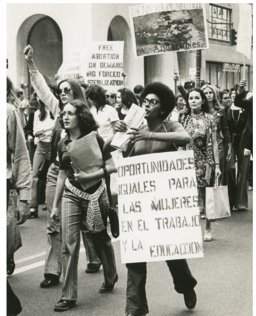
Women Strike for Equality Day, August 26, 1970