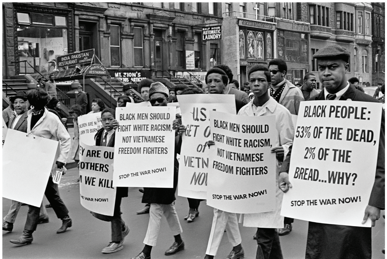
Harlem Peace March (With Brownstones), Builder Levy, April 15, 1967, courtesy of the photographer

FREEDOM AT HOME, FREEDOM ABROAD: Communities of Color Protesting Vietnam, 1965-1975