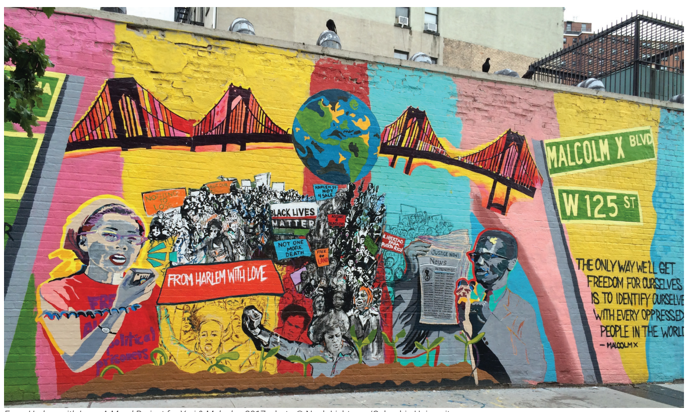
From Harlem with Love: A Mural Project for Yuri & Malcolm, 2017