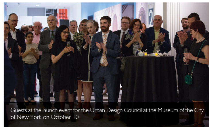
Guests at the launch event for the Urban Design Council at the Museum of the City of New York on October 10