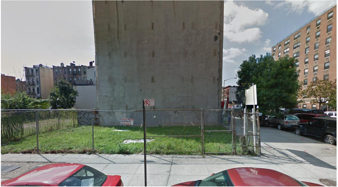
108th Street and Lexington Avenue, Manhattan.

You have been hired to build a park for a neighborhood! The park needs to fit on this block, without tearing down any existing buildings.