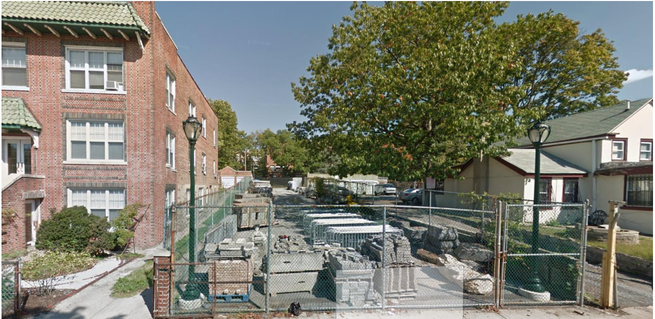
585 E. 191st Street, Bronx. Image captured from Google Maps, 2015

You have been hired to build a park for a neighborhood! The park needs to fit on this block, without tearing down any existing buildings.