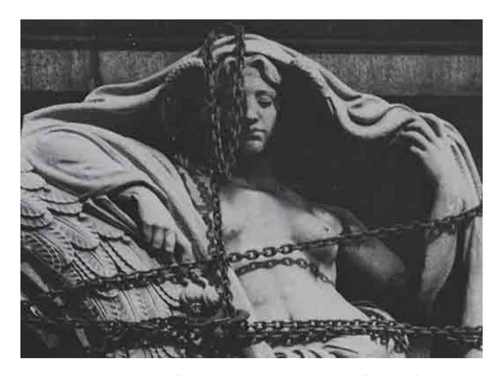
George P. Hall and Son, Interior of Pennsylvania Station, 1911. Museum of the City of New York.

STOP THE WRECKING BALL! Preserving City Landmarks 1950-1965