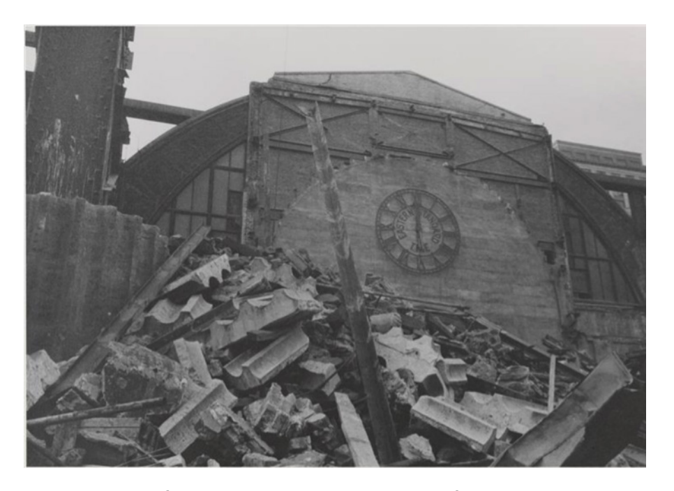
Aaron Rose, Untitled [The demolition of Pennsylvania Station, 1965], 1964-65. Museum of the City of New York.