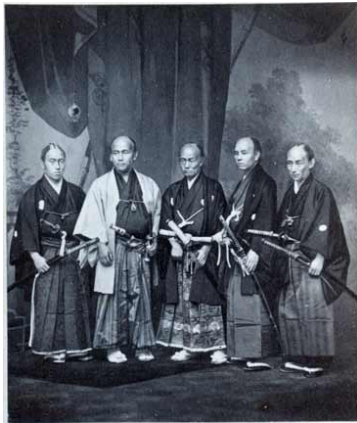
Samurai in New York: The First Japanese Delegation, 1860 [Members of the embassy], 1860 Carte-de-visite, Studio of C.D. Fredricks & Co., New York Collection of Tom Burnett

SAMURAI IN NEW YORK: The First Japanese Delegation, 1860 invites visitors to return to the New York of 150 years ago to share the city's excitement over the visit of a delegation of more than 70 samurai from Japan—the first Japanese to leave the closed island nation in over 200 years. The brash young city seized the opportunity to promote itself as the “Edo (modern day Tokyo) of the West” with a two-week whirlwind of parades and balls and moment-to-moment newspaper coverage of the delegation's visit. Extremely rare 19th-century photographs and newspaper engravings document the festivities, and a unique group of objects, lent by Japanese institutions, both record and recall the experience from the Japanese viewpoint. Other photographs, works of art, decorative and costume items reveal the cross-cultural influences that the visit inspired.